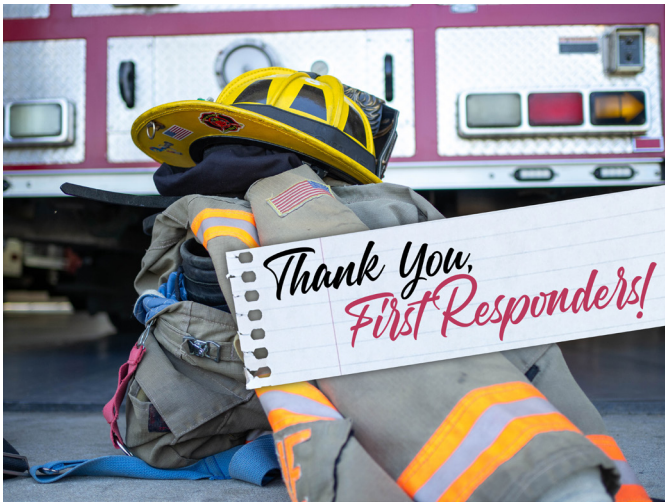
First Responders Sunday October 3, 2021

On October 3 Baden UMC will express their gratitude to the first responders that serve faithfully in our community. The police and fire departments, as well as the paramedics and ambulance personnel from Baden, Economy, Conway, and Ambridge, and their families will be invited to worship with us and join us in the Breakfast - Brunch following the worship service. During the service they will be recognized for their tireless contribution to our community. If you know of a first responder, please encourage them to attend.