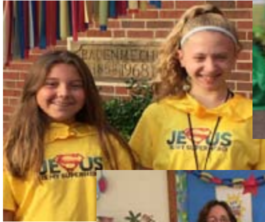
Vacation Bible School Hero Central - July 24-28